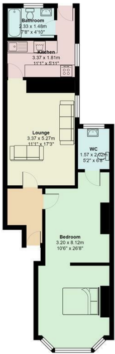
Albany Road, Roath

Total Area: 66.3 m 2 ... 714 ft 2 All measurements are approximate and for display purposes only